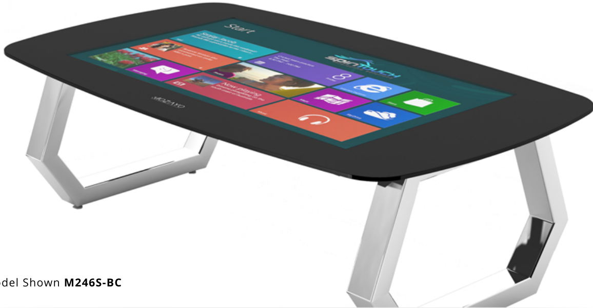
Model Shown M246S-BC

The Only Multi-Touch Table Without Compromise