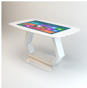
M246T-WW White on White