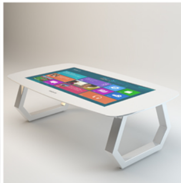
M246S-WW White on White