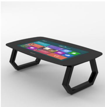
M246S-BB Black on Black