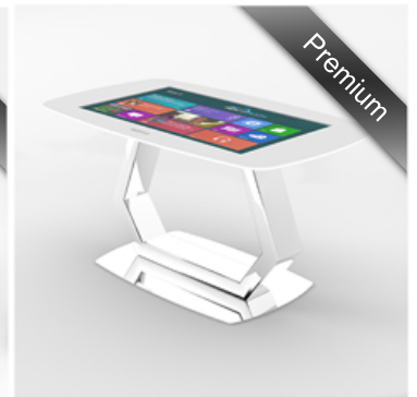
M246T-WC White on Chrome