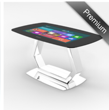
M246T-BC Black on Chrome