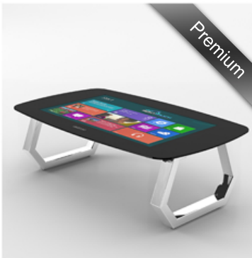
M246S-BC Black on Chrome