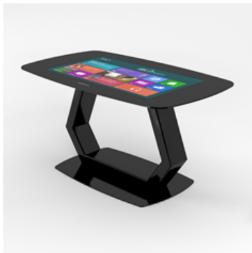
M246T-BB Black on Black