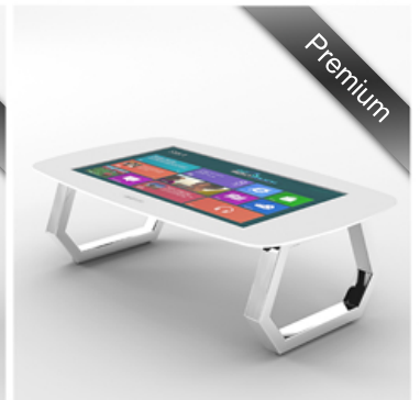
M246S-WC White on Chrome