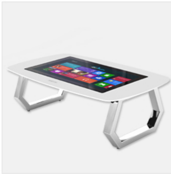
White on Silver