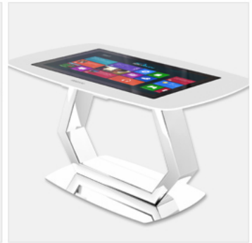
White on Silver