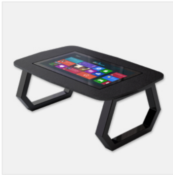
Black on Black